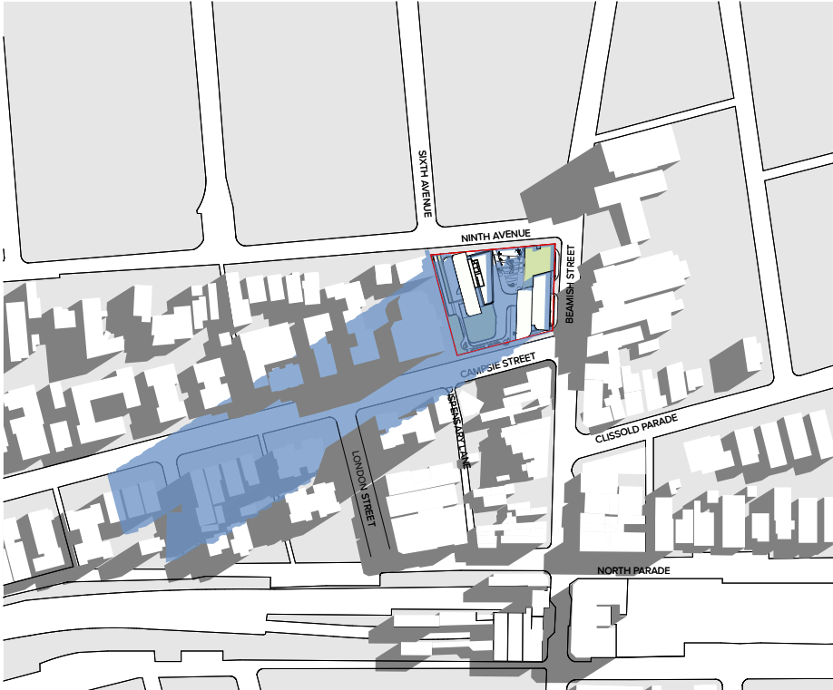
21st JUNE 9am