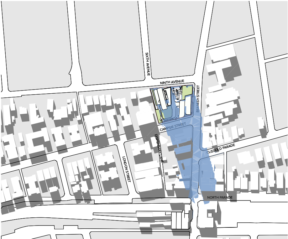
21st JUNE 2pm

NOTES THIS DRAWING IS COPYRIGHT © OF TURNER. NO REPRODUCTION WITHOUT PERMISSION. UNLESS NOTED OTHERWISE THIS DRAWING IS NOT FOR CONSTRUCTION. ALL DIMENSIONS AND LEVELS ARE TO BE CHECKED ON SITE PRIOR TO THE COMMENCEMENT OF WORK. IF WORK DIFFERS IN ANY DISCREPANCIES FOR CLARIFICATION BEFORE PROCEEDING WITH WORK. DRAWINGS ARE NOT TO BE SCALED. USE ONLY FOURED DIMENSIONS. REFER TO CONSULTANT DOCUMENTATION FOR FURTHER INFORMATION.