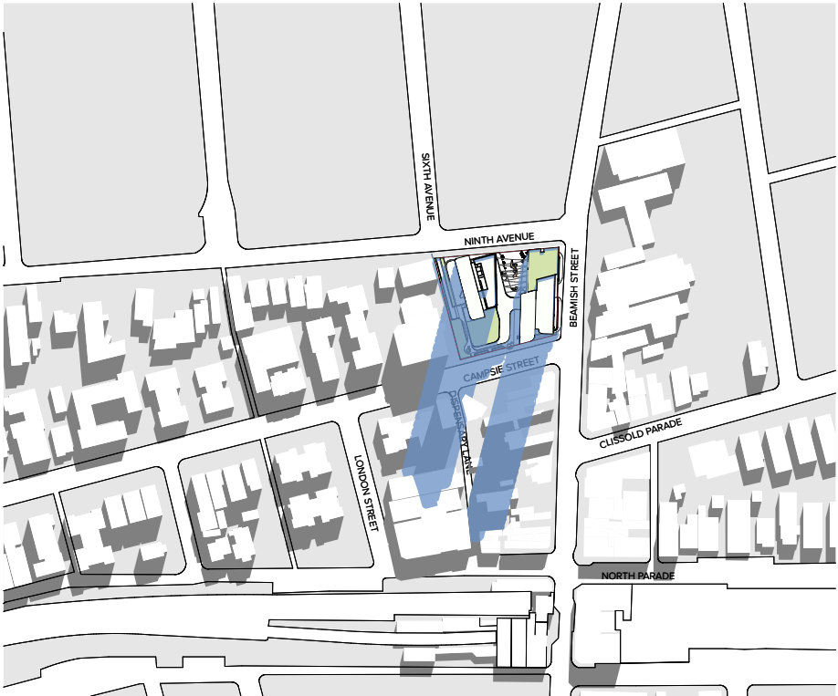
21st JUNE 12pm