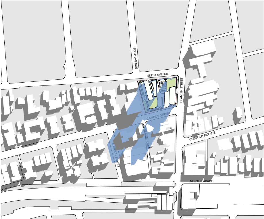
21st JUNE 11am