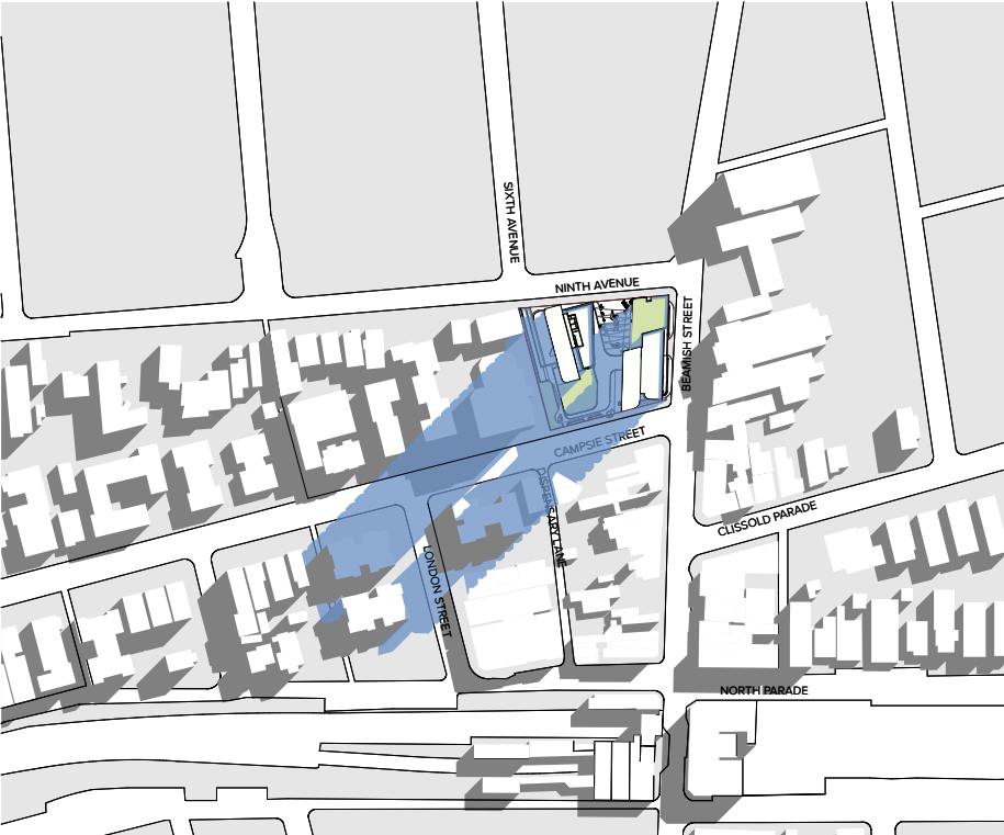
21st JUNE 10am